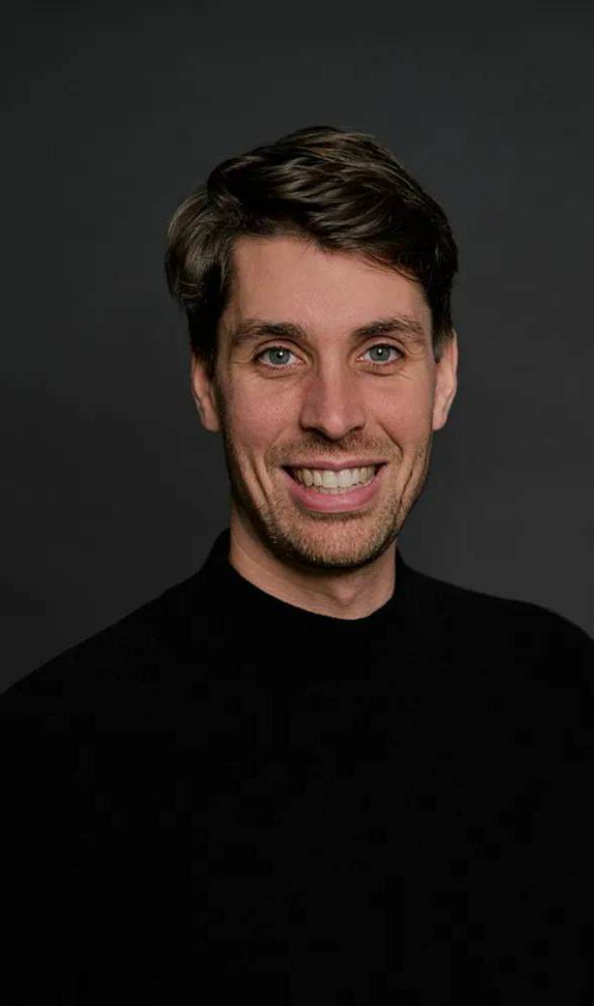
Floor FOUNDER, DESIGN & TECHNICAL DIRECTOR